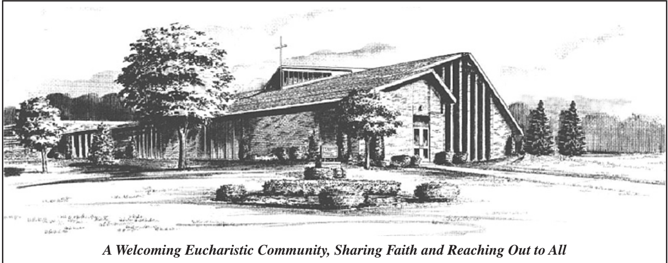
A Welcoming Eucharistic Community, Sharing Faith and Reaching Out to All

511 CHEAPSIDE ST., LONDON, ONTARIO N5Y 3X5 PHONE 519-433-6689 FAX 519-433-2301 E-MAIL: stmichlon@dol.ca www.stmichaelslondon.ca